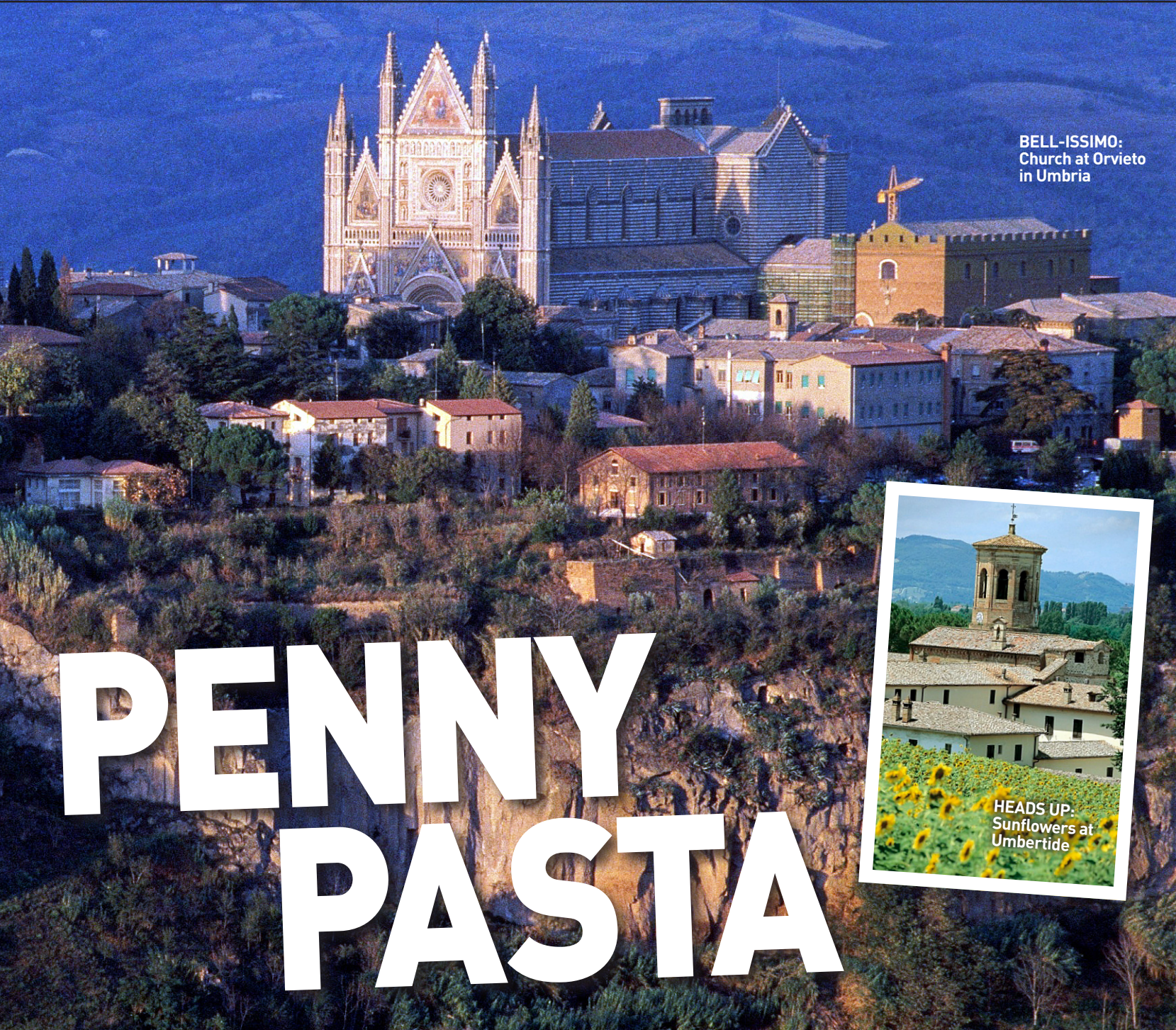
BELL-ISSIMO: Church at Orvieto in Umbria

GRAB a pair of trendy Raybans for your hols – from pastel shades, bold prints or the traditional black Wayfarers – all are discounted from £120 to £75. For a great deal go to www.sunglassesuk.com