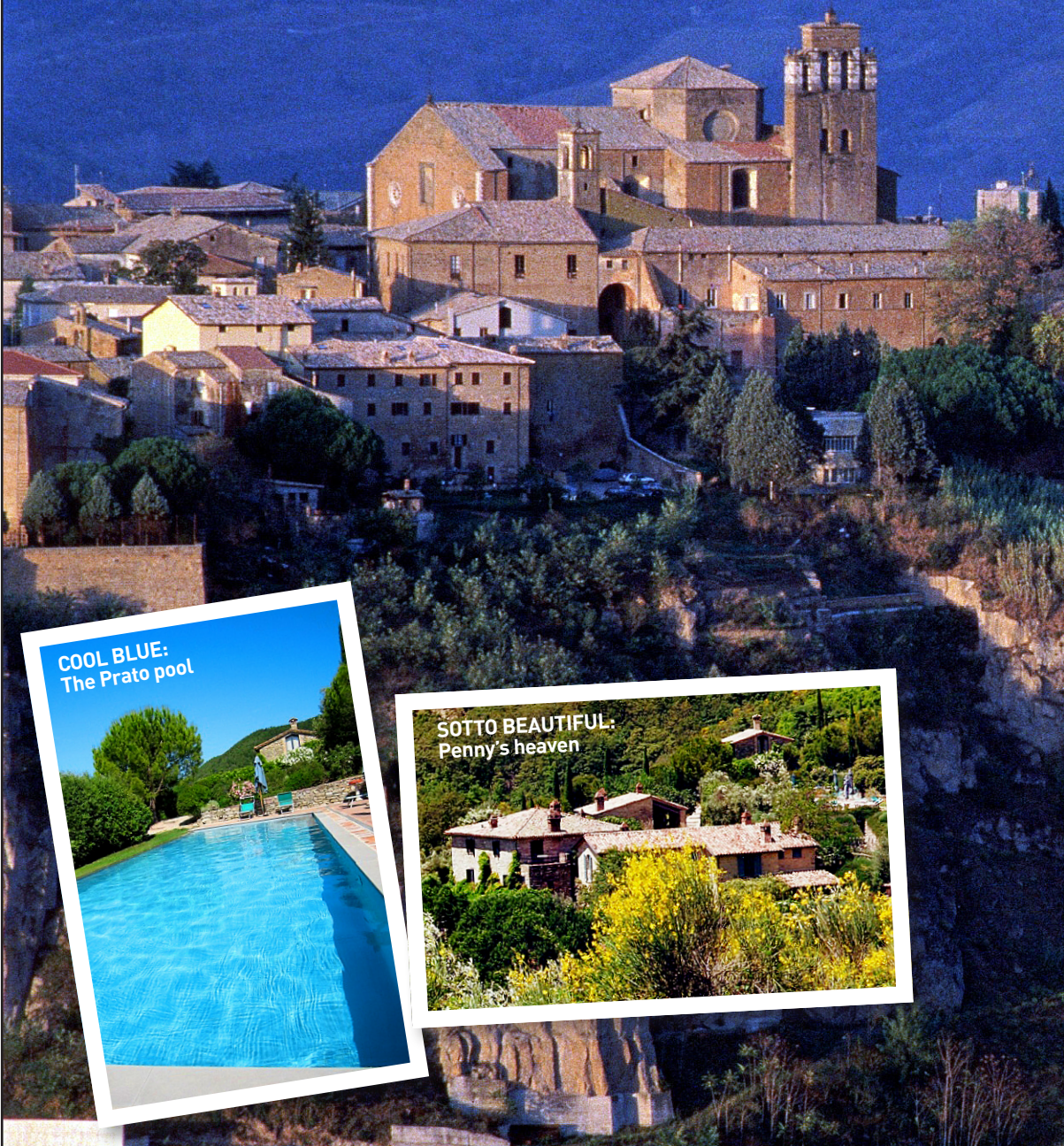
COOL BLUE: The Prato pool