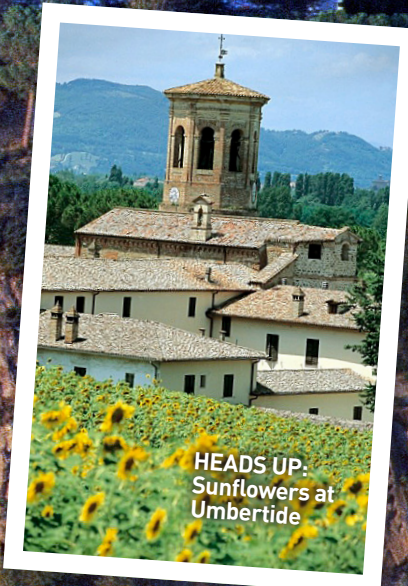
HEADS UP: Sunflowers at Umbertide

by the hilltop town of Montepulciano and its gloriously original boutique shops (I've been done for two handbags, three pots and so many shoes you'd think I was shackled up with a centipede).