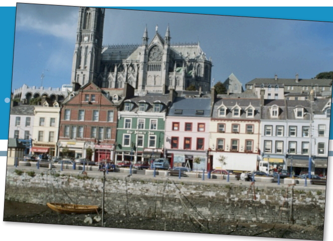
CAPTION: words go in here